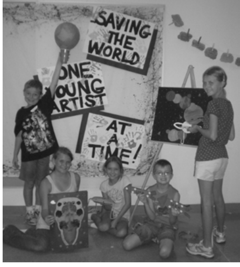
Pine Jog artists show off their solar system art during summer camp.

On a personal level, I have watched my daughter grow into a thriving toddler in a world of very uncertain economical and global times. In turn, I have witnessed many art teachers from around the state take on tremendous burdens and stress with educational budget cuts that have threatened