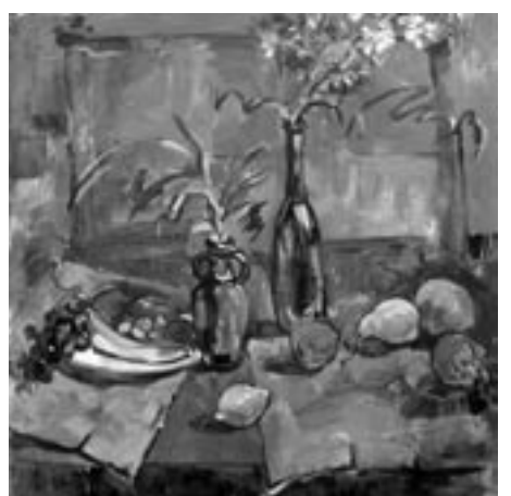
World's Edge, Oil on gallery wrapped canvas, 2005