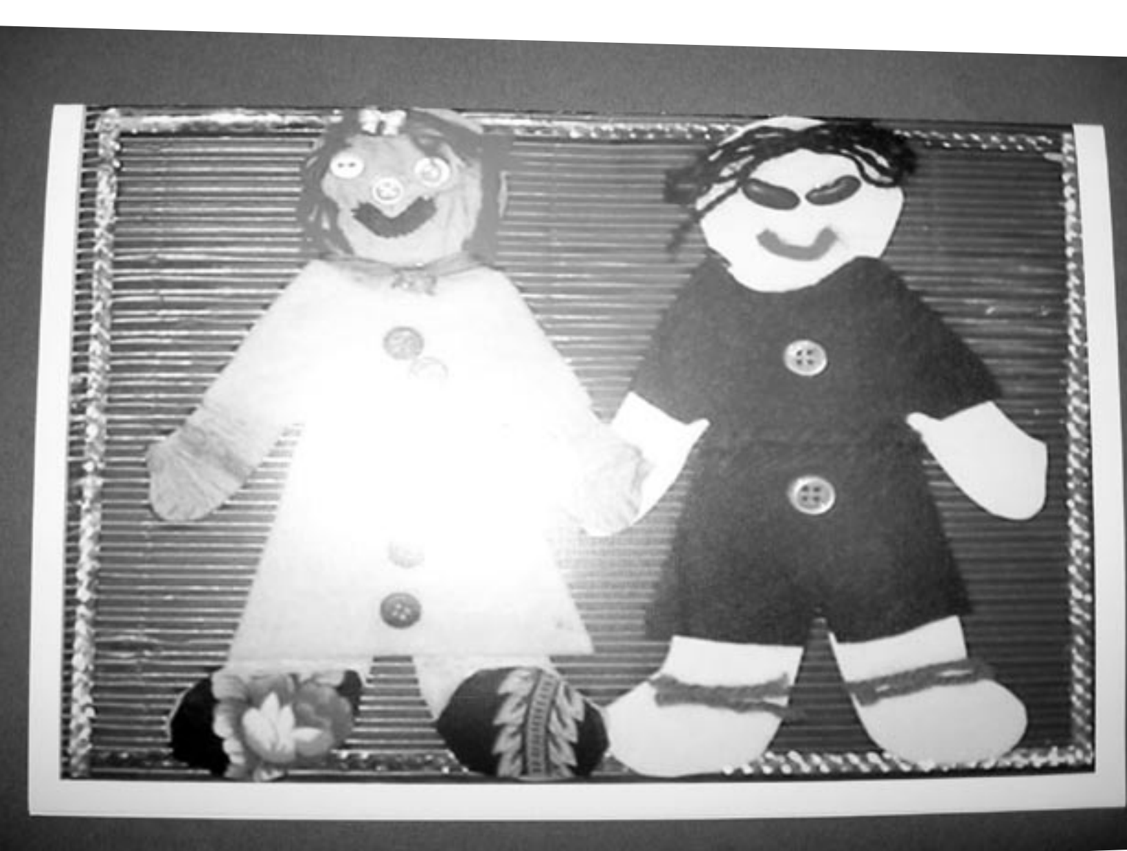
Cover of the VSA arts of Florida holiday card