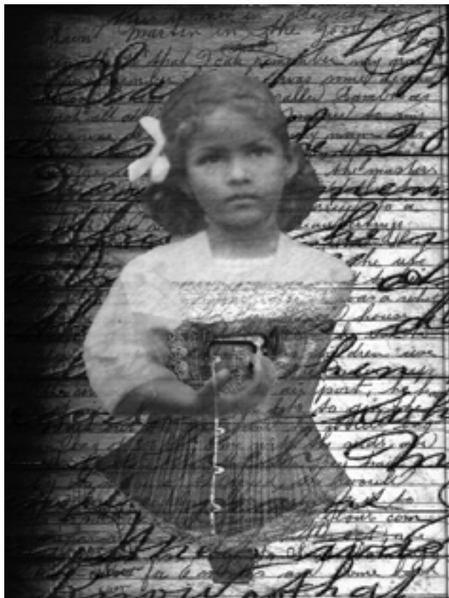
Grandma Doll, Mixed Media

My situation is complicated by the fact that in addition to being a full time teacher, I am a full time graduate student in art education at the University of Florida. I also have a husband and four very active children ranging in age from eight to thirteen!