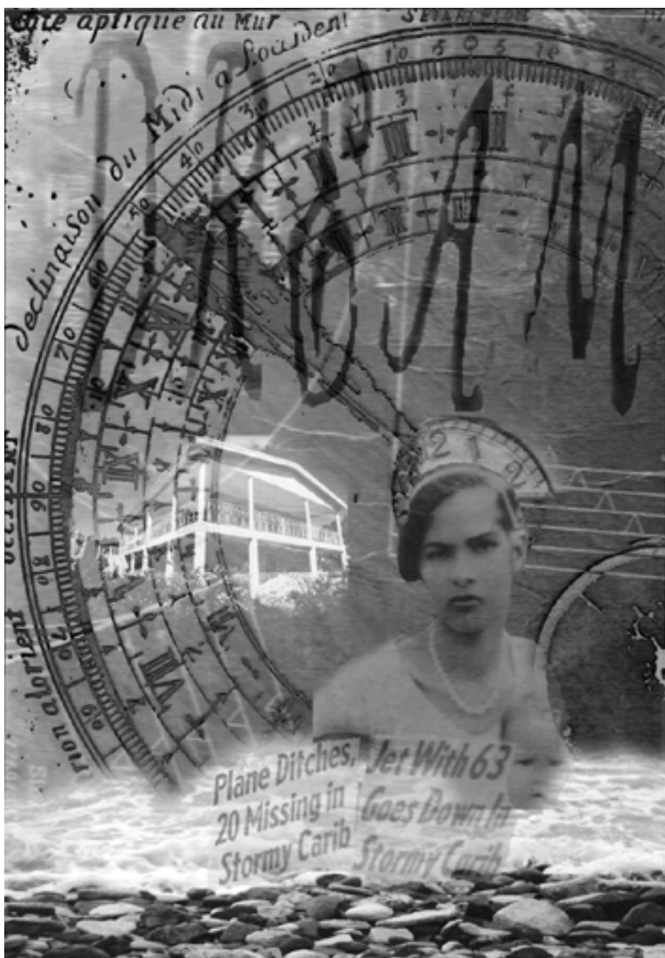
Plane Crash, Mixed Media